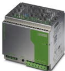
DIN rail power supply unit 24 V DC/20 A, primary switched-mode, 3-phase.

Please be informed that the data shown in this PDF Document is generated from our Online Catalog. Please find the complete data in the user's documentation. Our General Terms of Use for Downloads are valid ( http://phoenixcontact.com/download )